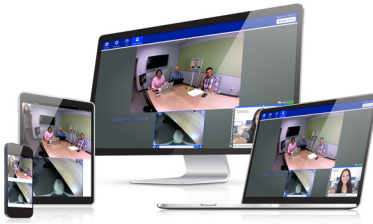
The Beam App

BeamPro® puts you in the room with the people who matter most.