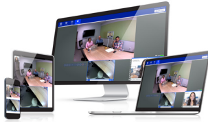
The Beam App

Beam® puts you in the room with the people who matter most.